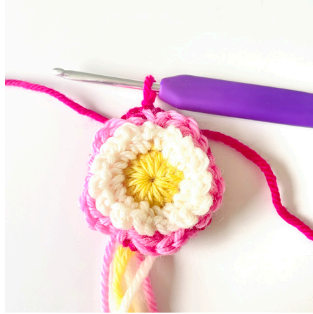
Round 4 (from front)